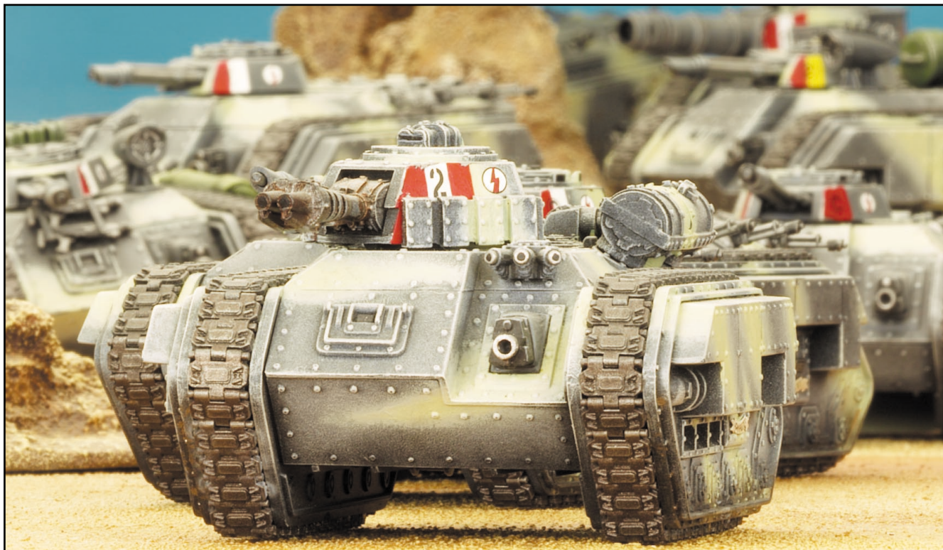
A Steel Legion column makes its way through the desert.

There is a role in any army for high-speed vehicles. These are usually smaller vehicles which will often be used to reconnoitre ahead of an army or rapidly deploy heavy weapons systems or infantry squads to critical parts of the battlefield. Some races, such as the Eldar, use fast vehicles almost exclusively (Falcons, Vypers, etc)